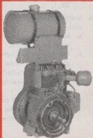
View showing Adaptor

The WISCONSIN MODEL BKN HAS BEEN ADAPTED TO THE GRAVELY TRACTOR SO THAT THE MANY OWNERS OF THIS FINE MACHINE CAN TAKE ADVANTAGE OF MODERN HIGH QUALITY DESIGN, EFFICIENT PERFORMANCE AND THE BEST IN FUEL ECONOMY.